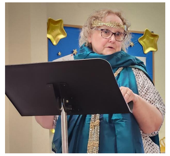
Through narration, listening to messages and by acting out portions of scriptures

assignment this weekend was to read and study the entire Book of Esther.